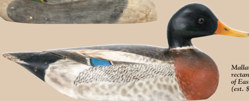
Mallard with crossed wingtips and rectangular stamp by A.E. Crowell of East Harwich, Massachusetts (est. $7200/10,800) sold for $5100.