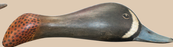
Rare blue-winged teal head plaque by A.E. Crowell (est. $1200/1800) sold for $2280.