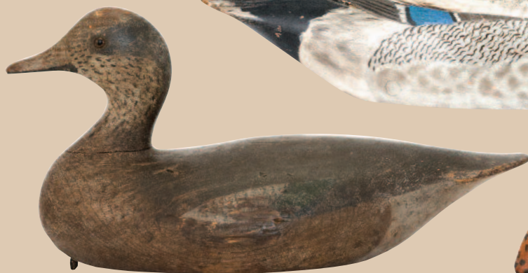
Wigeon by Joe Lincoln of Accord, Massachusetts (est. $4800/7200) sold for $3480.