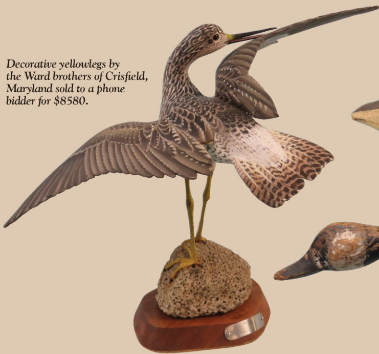
Decorative yellowlegs by the Ward brothers of Crisfield, Maryland sold to a phone bidder for $8580.