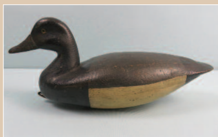
Hollow bluebill by Eugene Birdsall of Point Pleasant, New Jersey brought $1100.