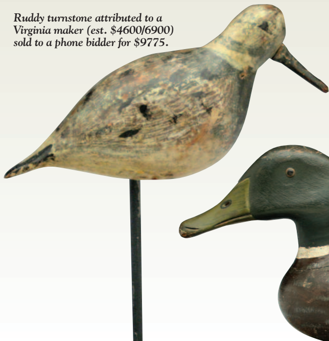
Ruddy turnstone attributed to a Virginia maker (est. $4600/6900) sold to a phone bidder for $9775.

Five contemporary decorative lots made the top 25 list, topped by a preening pintail hen, signed and dated 1998, by Jett Brunet of New Orleans at $15,525, an auction price record for its maker. An oversized mallard by