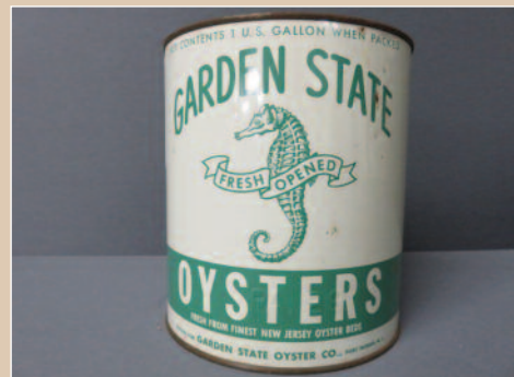
Rare Garden State oyster can sold for $3190.

two-day sale that it seems like just about everyone was able to buy something. Barfield's actually used four different auctioneers to move the items. Quite a number of dealers who attend these events use them as an opportunity to add inventory. One Maryland collector, who must have bought 30 decoys, was intending to sell them at the upcoming East Coast Decoy Collectors get together in St. Michaels, Maryland in April.