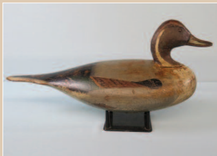
Sculptural pintail by Ira Hudson with some repaint, possibly by Lem Ward, sold for $3960.