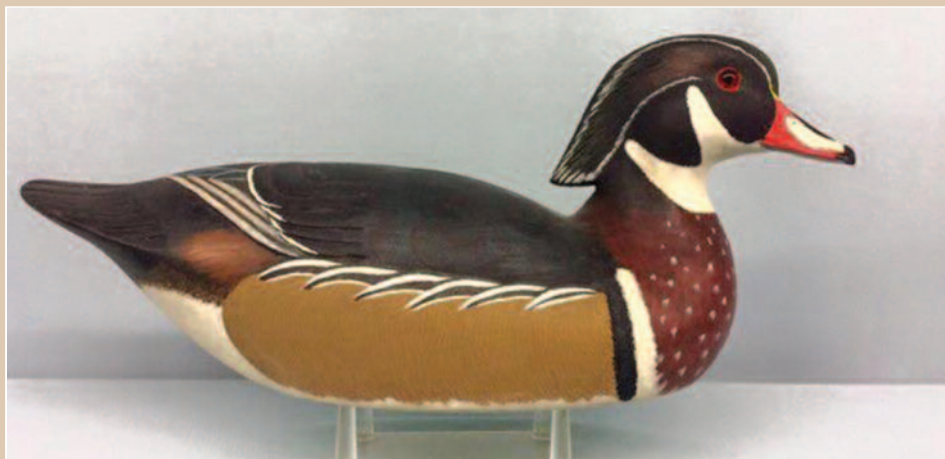
Rare possibly one-of-a-kind wood duck by Delbert "Cigar" Daisey sold for $5170, the top lot in the auction.