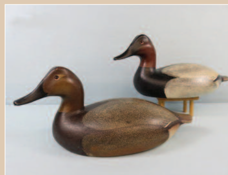
Pair of canvasbacks, signed and dated 1963, by the Ward brothers sold for $4840.