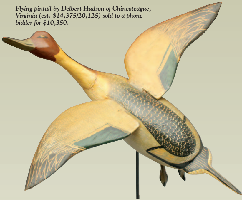
Flying pintail by Delbert Hudson of Chincoteague, Virginia (est. $14,375/20,125) sold to a phone bidder for $10,350.