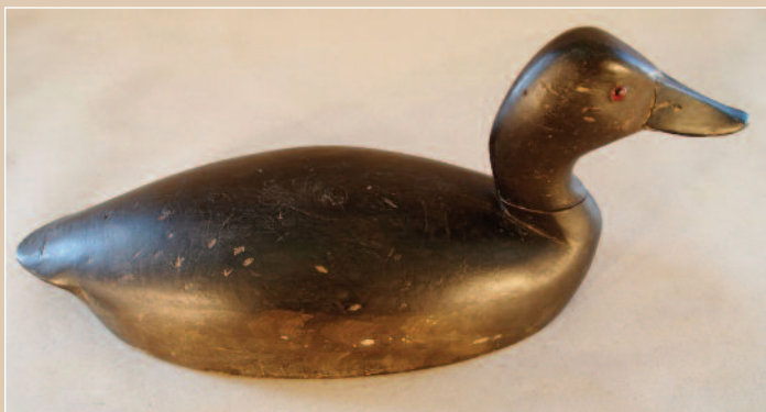
Hollow-carved canvasback hen by Tom Chambers of Ontario sold for $2090.