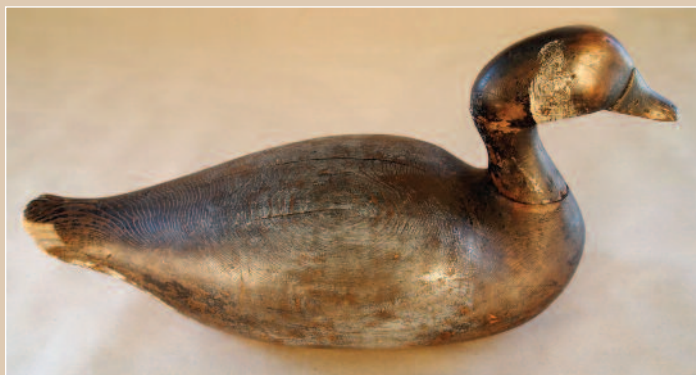
Early Canada goose by the Petersen decoy factory of Detroit brought $1100.