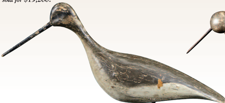
Greater yellowlegs by Ira Hudson of Chincoteague, Virginia (est. $18,000/30,000) sold for $19,200.