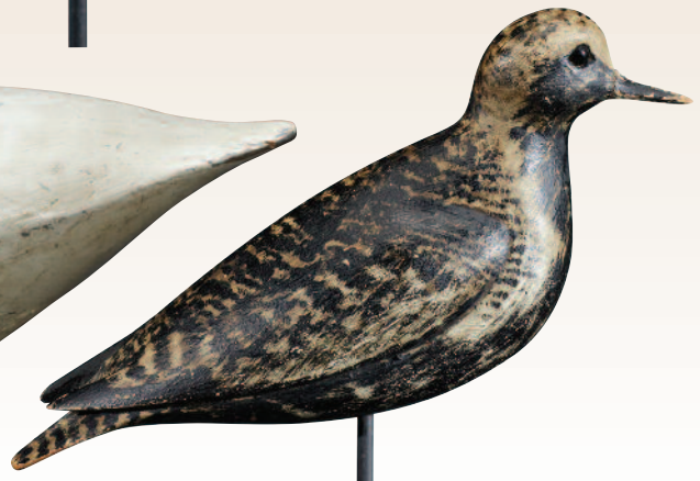
Black-bellied plover by Charles Sumner Bunn (est. $60,000/84,000) sold to a New Jersey collector for $69,000.