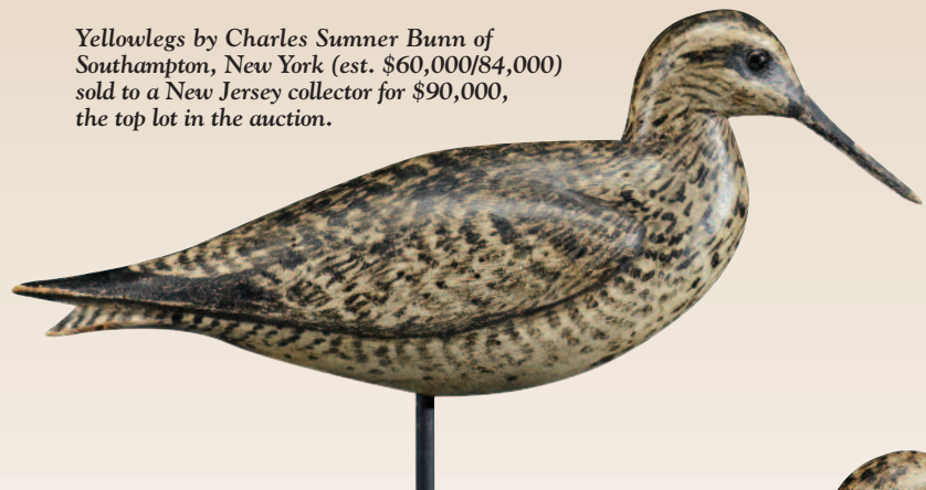
Yellowlegs by Charles Sumner Bunn of Southampton, New York (est. $60,000/84,000) sold to a New Jersey collector for $90,000, the top lot in the auction.