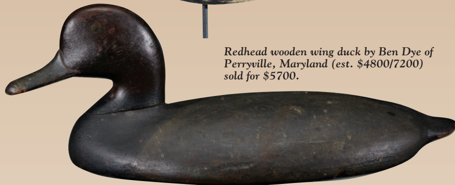
Redhead wooden wing duck by Ben Dye of Perryville, Maryland (est. $4800/7200) sold for $5700.