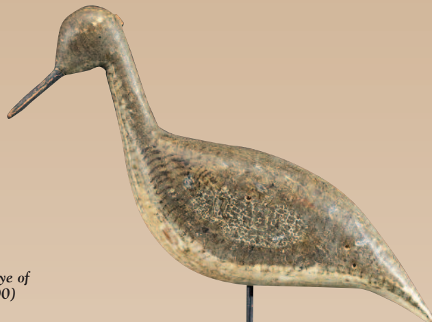
Yellowlegs by Lew Barkalow of Forked River, New Jersey (est. $12,000/18,000) sold for $13,200.