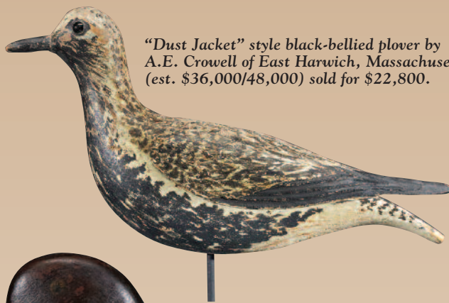
"Dust Jacket" style black-bellied plover by A.E. Crowell of East Harwich, Massachusetts (est. $36,000/48,000) sold for $22,800.